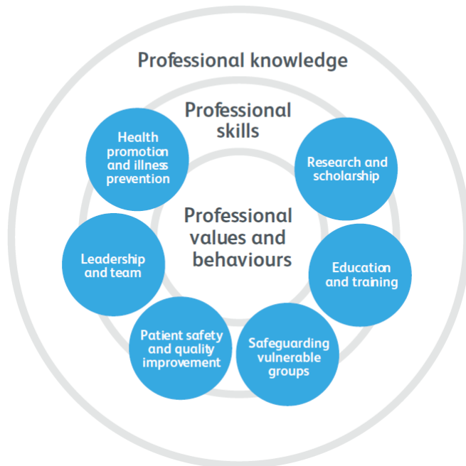
The nine domains of the GMC's Generic Professional Capabilities

Good medical practice (GMP) 11 is embedded at the heart of the GPC framework. In describing the principles, duties and responsibilities of doctors the GPC framework articulates GMP as a series of achievable educational outcomes to enable curriculum design and assessment.